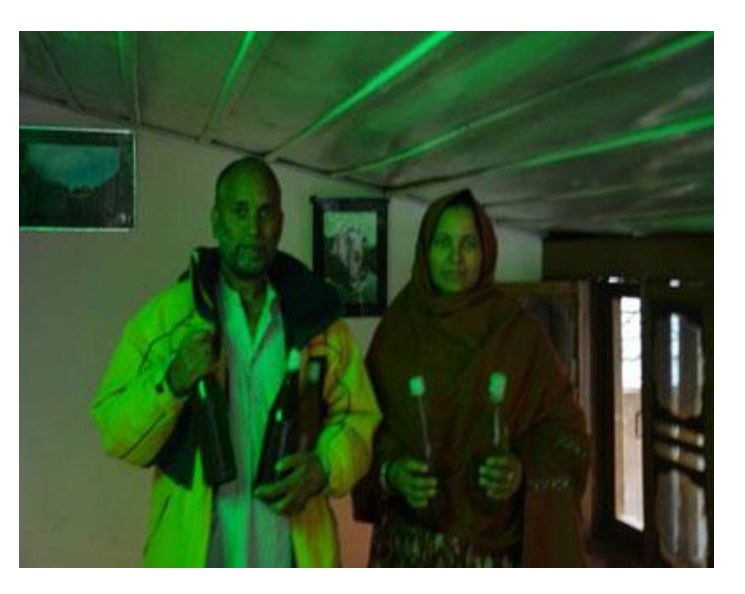
A tribal farmer with his Quality Produce